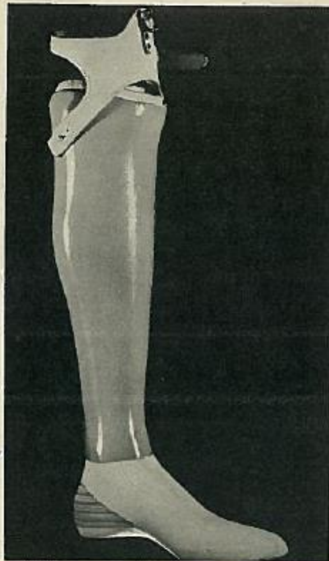
FIGURE 4.—Modern plastic artificial leg made for below-knee amputee.