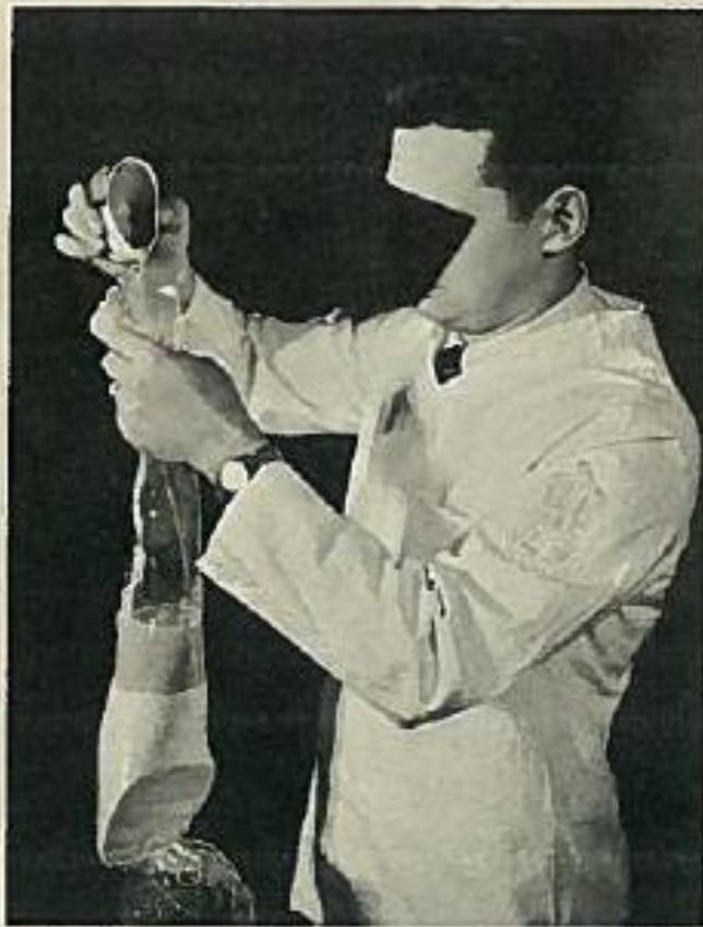
FIGURE 3.—Typical plastic lamination procedure using plaster-of-paris modified replica of the stump as the inner part of the mold to which a separator is applied and a polyvinyl alcohol sleeve as the outer portion of the mold. Stockinet has previously been pulled over the plaster-of-paris inner mold.